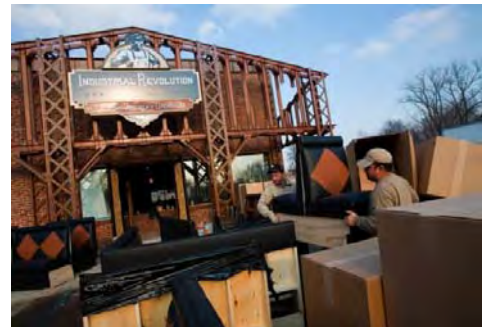
Construction workers carry in a seat to be installed at the Industrial Revolution Eatery and Grille in Valparaiso. The restaurant is expecting an April opening.

"I hope people (who eat here) will walk away motivated and inspired," Leeson said. The restaurant is expected to open in mid-April.